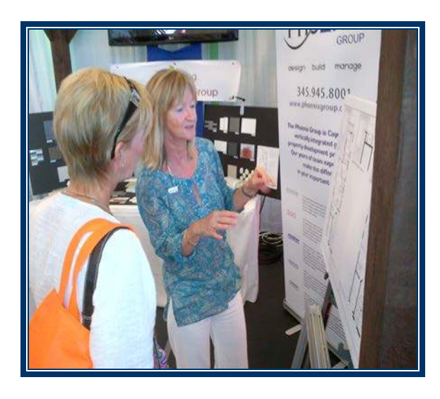
A Phoenix Client gets a first look at the Seagate product

Pricing begins in the mid CI$800,000s and the units will be built as they are sold.